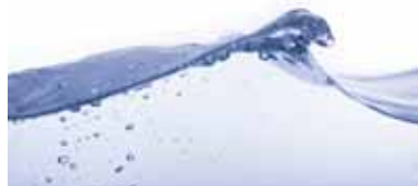
Purified Water | Crystal Clean