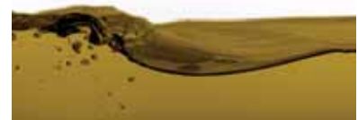
Backwash Water | Dirty and Mucky